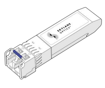
Figure 1. SFP Dual Fibre (non-binding illustration)

4. The optical input to the receiver should not exceed this value. Transmitters must never be directly connected to receivers (optical loop back) before ensuring that proper optical attenuation is used.