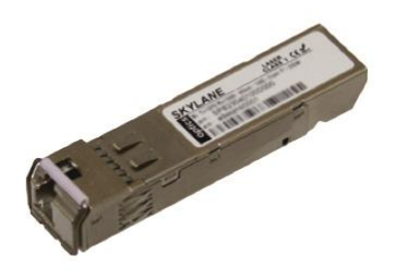
Figure 1. SFP+ Single Fibre (non-binding illustration)