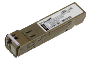
Figure 1. SFP+ Single Fiber (non-binding illustration)