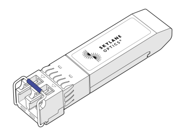
Figure 1. SFP Dual Fibre 1310nm (non-binding illustration)